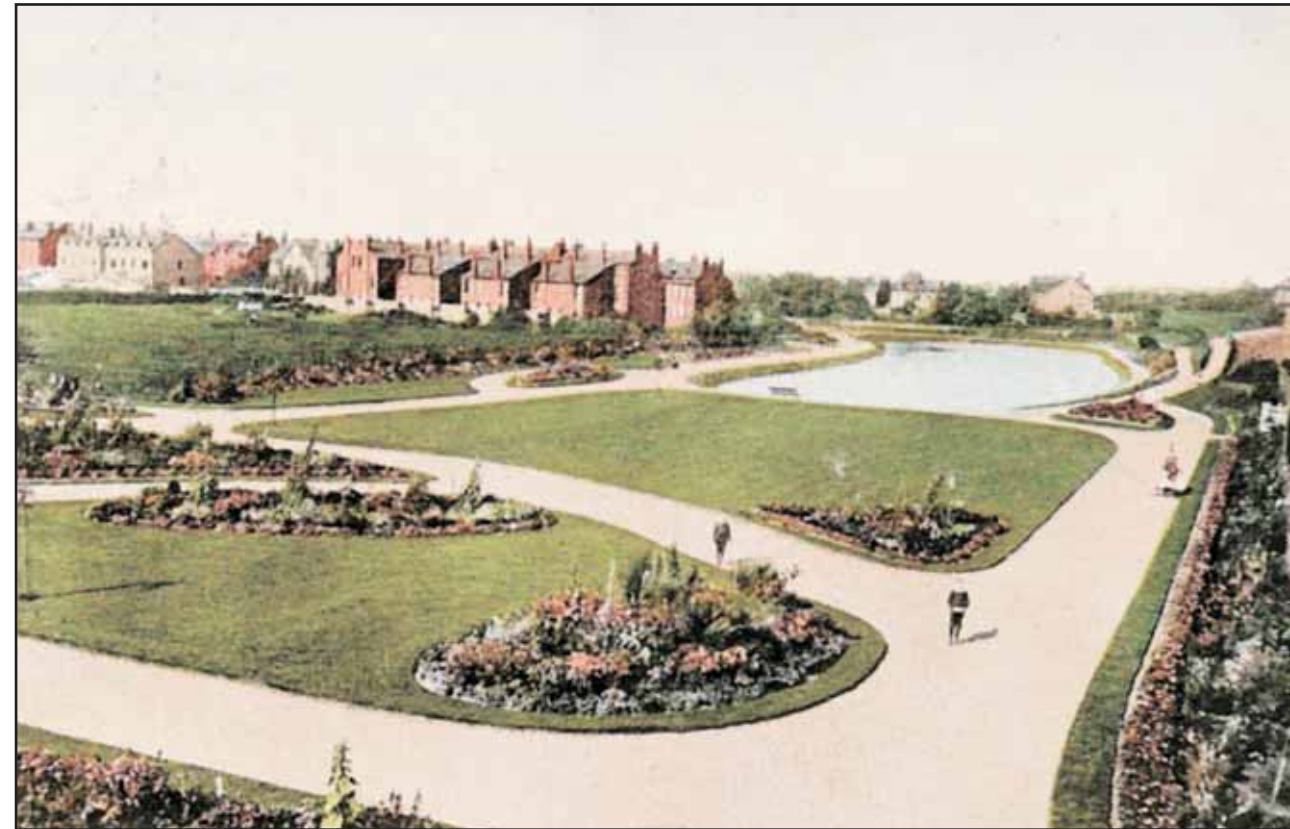
Lower Park circa 1902

This was resolved in 1908 when the West Kirby Park Club moved to the Upper Park. Early photos suggest that the Lower Park green did not conform to the shape and size of today's greens and that it was at times used for croquet and quoits. The old green was rebuilt, West Kirby Victoria returned and have played in the Lower Park ever since.