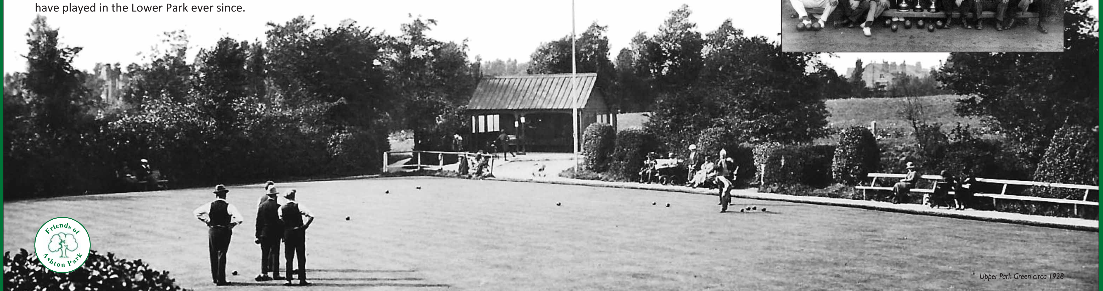
Upper Park Green circa 1928