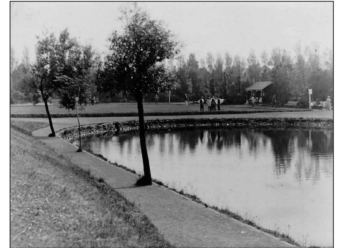
The Improved Lower Park Green after 1921

Funded by Grant from the Wirral West Community Fund